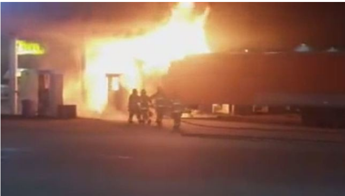
RAW VIDEO: Fire at Goshen gas station (/news/local/gallery/raw-video-fire-at-goshen-gas-station)