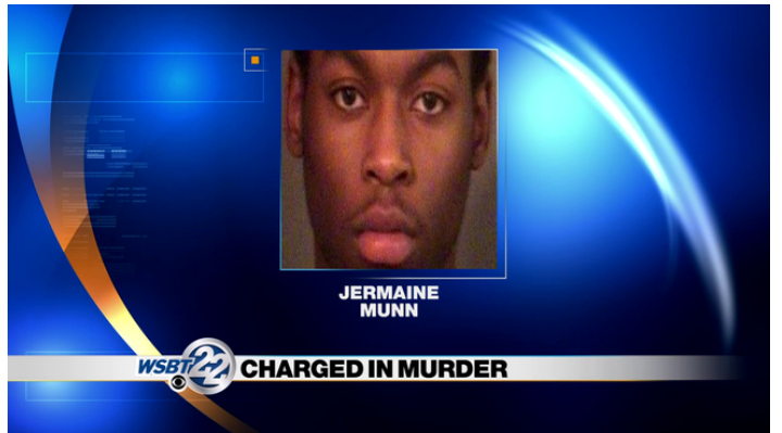
Teen, already in prison for South Bend murder, about to go on trial for another murder (/news/local/gallery/teen-already-in-prison-for-south-bend-murder-about-to-go-on-trial-for-another-murder)