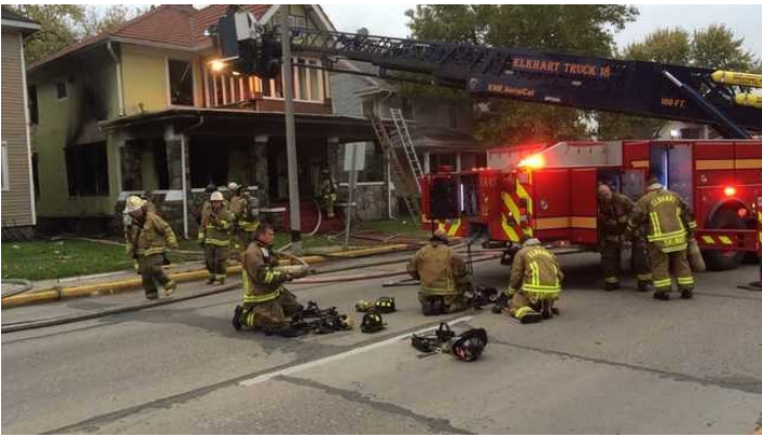
BREAKING UPDATE: Elkhart woman suffers second and third degree burns (/news/local/gallery/medflight-dispatched-for-person-injured-in-elkhart-apartment-fire)