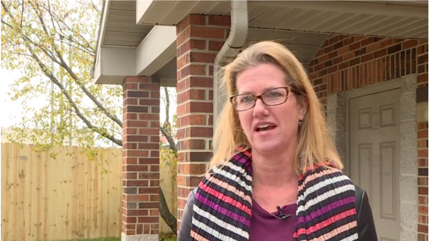
South Bend abortion clinic to open soon. // WSBT 22 Photo

by Jessi Schultz, WSBT 22 Reporter Monday, October 30th 2017