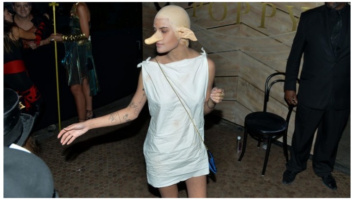
GALLERY: Celebs get spooky for Halloween (/news/entertainment/gallery/gallery-celebs-get-spooky-for-halloween)